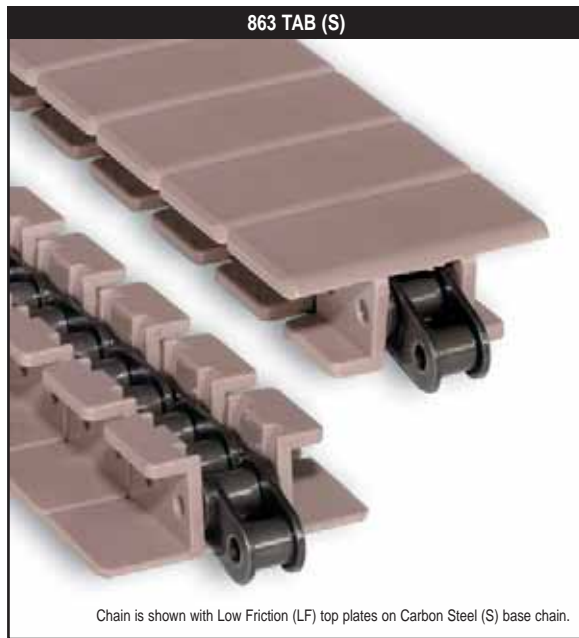
Chain is shown with Low Friction (LF) top plates on Carbon Steel (S) base chain.