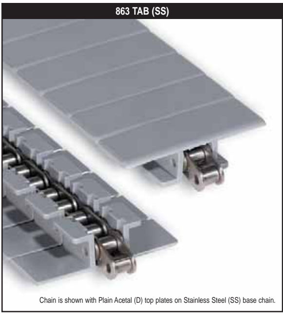
Chain is shown with Plain Acetal (D) top plates on Stainless Steel (SS) base chain.